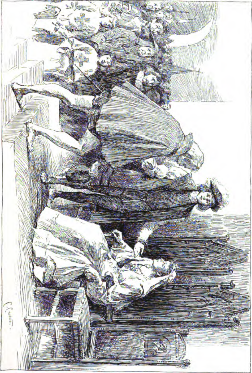
“GRANDEST SAILOR OF THE ZONES.”